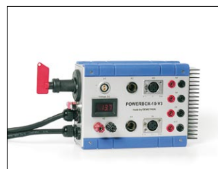
DEWE-POWERBOX-10 DC Power distribution box